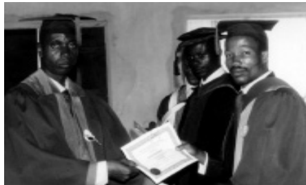
First International School - Amasri, Nigeria