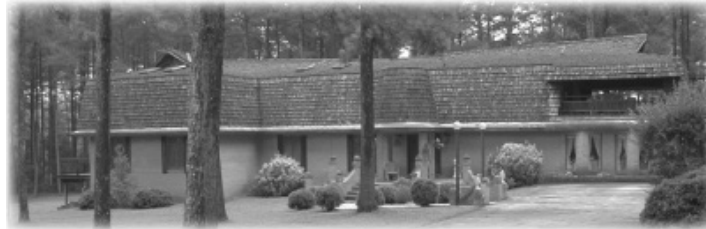
FIRST MTC FACILITIES IN CLEVELAND, TENNESSEE